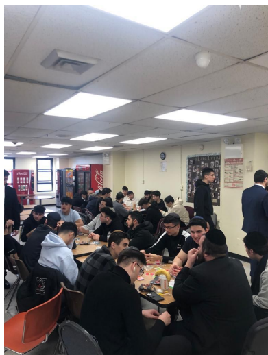
Rosh Chodesh Adar Games