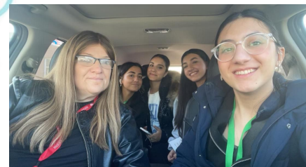
Model U.N. in Connecticut